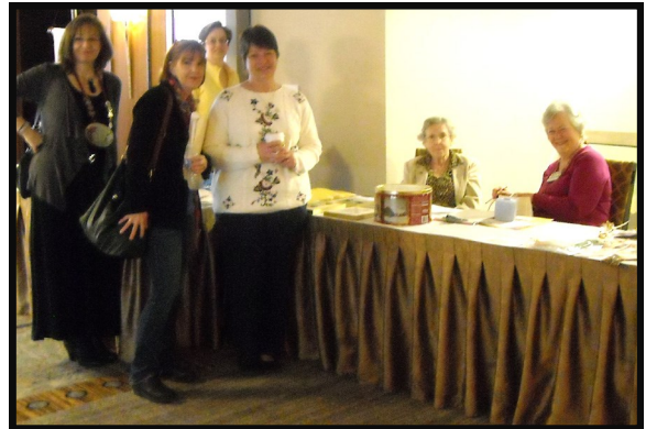
MAR Registration Table