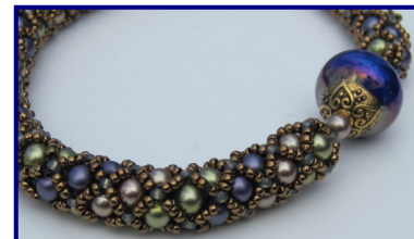
Gloria Beaded Bracelet