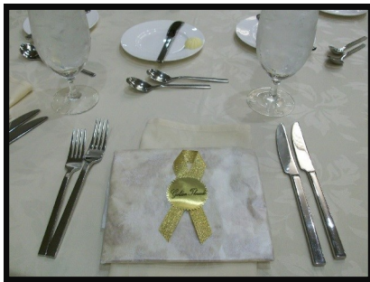
Place Setting from 50th Anniversary Luncheon