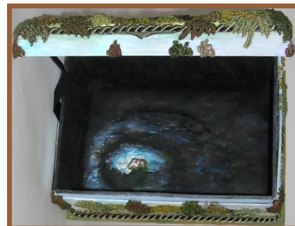
"The Journey" inside

Pathways provided lines of interest and movement around the sides repeating the theme of travel. Inside the box the contrast of a dark landscape draws the eye inward and toward the brightly lit focal point repeating a reversed Golden Section spiral, materials, and stitches from the outside. This point represents the culmination of awe and surprise of a compelling passage to the future.