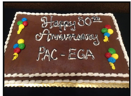
And what is a celebration..... unless it has cake!