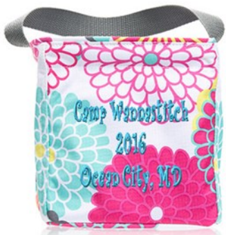
Option 1—Flower Bag