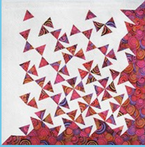
Tumbling Triangles Quilting (Friday All Day Class)