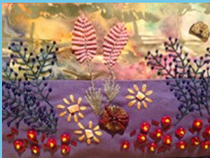
Not Your Grandmother's Embroidery (Saturday All Day Class)