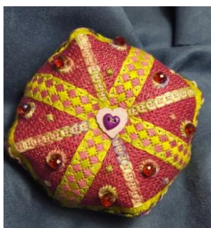
Birthday Biscornu Pincushion Or Frame Weight

FINISHING with Beth Shaw of the Polished Needle