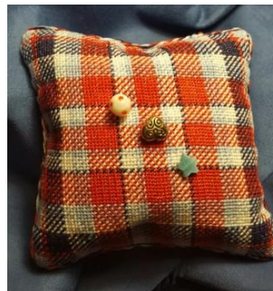
Birthday Frame Weight Pillow