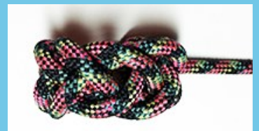
Decorative Knot Tying (Saturday Half Day Class)