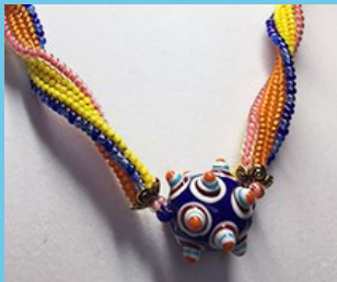
Out of This World Necklace (Friday All Day Class)