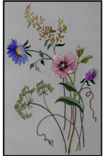
Coupon located in attached coupon/flyer.

Supplies (approximate): $20; DMC floss, broadcloth ground fabric