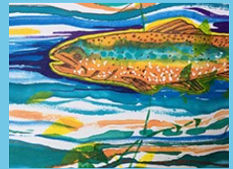
Designing Fabulous Fabric (Friday Half Day Class) by Sharon Wall