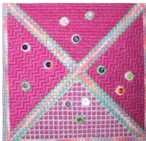
Alternate back pattern for Birthday Biscornu

We all struggle with finishing and have so many UFO's that our families don't know what they are going to do with them all.