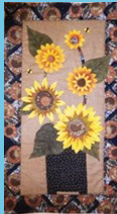
Quilting with Silk Flowers (Saturday All Day Class)