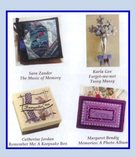
EGA'S Alzheimer Project